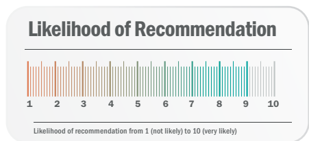
Fig. 3: Likelihood of recommendation from 1 (not likely) to 10 (very likely)

Discussion and Conclusion: As a result of this survey Sutter radiofrequency technology with the impedance-controlled CURIS® 4 MHz radiofrequency generator is a frequently used technology for various ENT indications. Results show a high level of satisfaction among the participants of the survey. Users perceive the CURIS® 4 MHz radiofrequency generator as a very easy-to-use, durable and reliable product that they would recommend to other surgeons. Moreover, it turns out to be a cost- and time-efficient technology compared to other technologies. This makes the CURIS® 4 MHz radiofrequency generator both clinically beneficial and well accepted by surgeons. The results confirm the outcomes of numerous case studies and peer-reviewed scientific journal articles [2,3] and show once more the importance and the versatility of the CURIS® 4 MHz radiofrequency generator for different fields of ENT surgery.